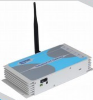
Industrial IoT Gateway