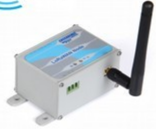
LoRa Connectivity Solution