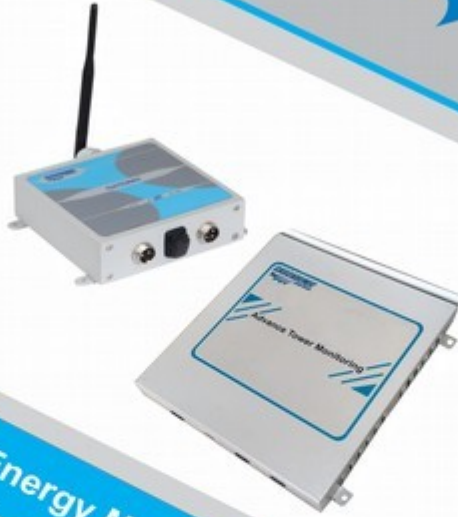
Energy Monitoring Solution