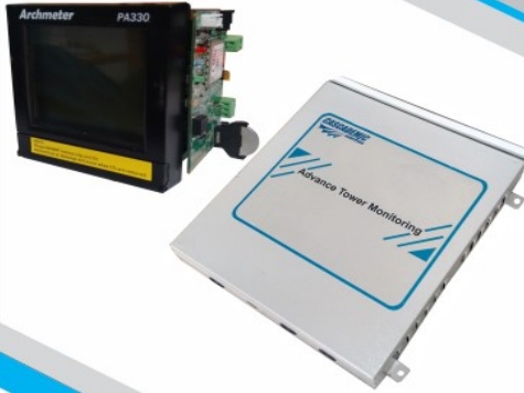
Energy Monitoring Solution