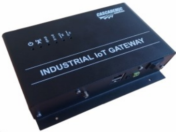
Industrial IoT Gateway