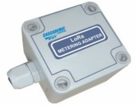
LoRa Connectivity Solution